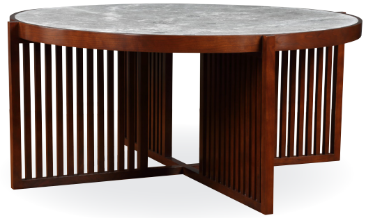
Park Slope Round Cocktail Table 1550 | H19 D43