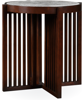
Park Slope End Table 1551 | H23 D22