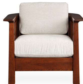
Park Slope Chair 1562 | H29 W34.5 D35.25