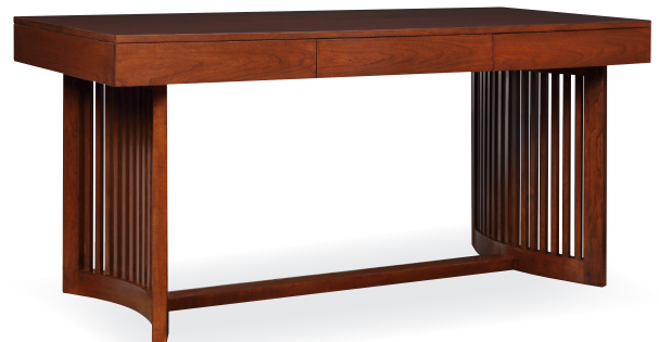
Park Slope Spindle Desk 1559 | H30 W63 D28