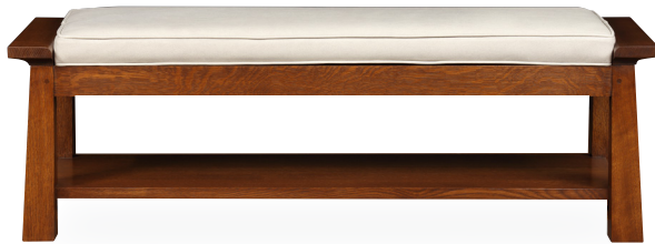
Park Slope Bench 1519 | H17.5 W52 D17.5