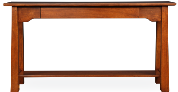
Park Slope Console Table 1567 | H29 W56 D16