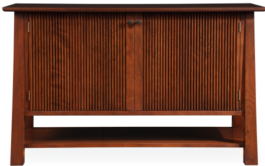
Park Slope Entertainment Console 1572 | H32 W52 D22

Each piece of Stickley Furniture is made to order, allowing you to customize the piece's ultimate look. For Park Slope, choose white oak for a deeply grained, dimensional appearance, or cherry for a subtler grain, rich in patina. These attributes are also affected by a variety of finish options, which can lend the same piece of furniture a modern or traditional look. And because wood mellows with age, developing its own rich glow, time itself is the final element that makes each piece from Stickley a wise investment and a unique work of art.