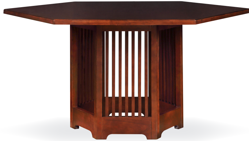
Park Slope Hex Table 1531 | H30 W60

Stickley finishes are hand-applied in multiple layers, achieving a clarity seldom seen in furniture today. Every detail of the wood grain is not merely visible but beautifully enhanced. The final step is a careful hand-rubbing process that creates the desired luster. Made with no dipping and no conveyor belts, a Stickley finish is uniquely “hands-on.”