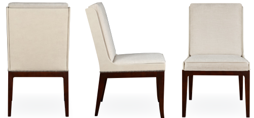
Park Slope Shelter Chair 1533 | H36 W21.5 D25.5

The Park Slope trestle table has a distinctly modern feel. At its base, spindles are arranged in two broad bows to provide a fresh perspective from every direction. The shape is echoed in the subtle, perfect curves that form the Park Slope shelter chairs.