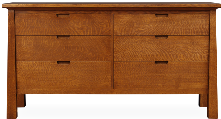
Park Slope Master Dresser 1512 | H37 W67.5 D22