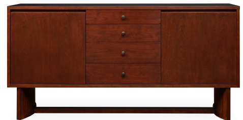
Park Slope Sideboard 1536 | H34 W67 D21.5