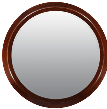
Park Slope Mirror 1518 | D48