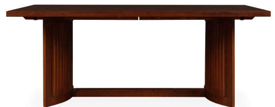
Park Slope Dining Table 1530 | H30 W42 (extends to 114")