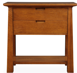
Park Slope Open Night Stand 1515 | H29 W30 D18