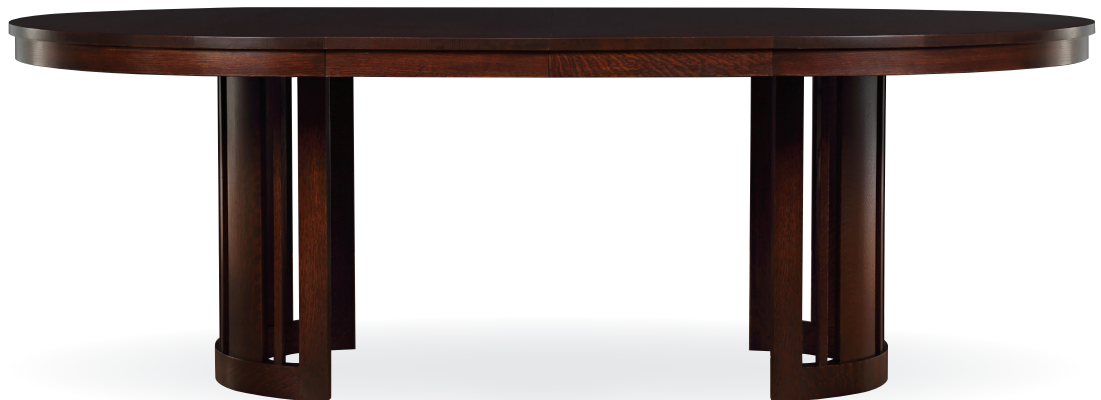
Park Slope Round Dining Table [shown extended]