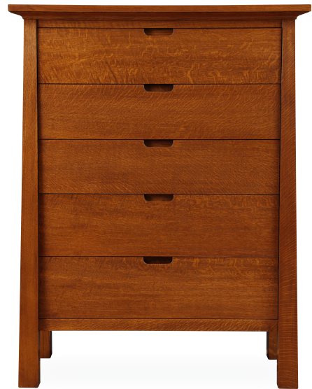
Park Slope Tall Chest 1513 | H56 W43 D22