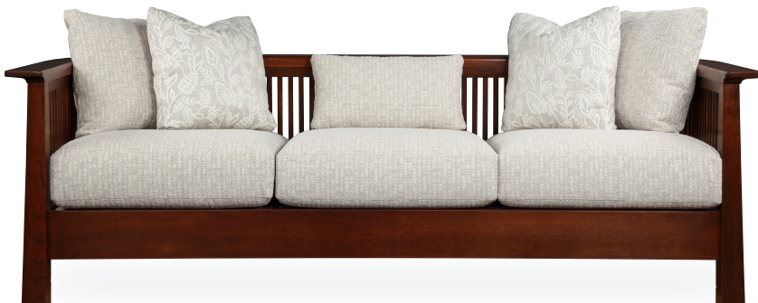
Park Slope Scatter Back Sofa 1560-SB | H29 W90 D35.25