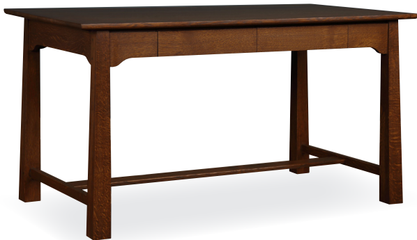
Park Slope Desk 1558 | H30 W56 D29